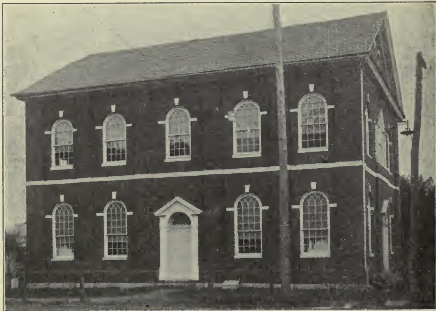
ST. MICHAEL'S EVANGELICAL LUTHERAN CHURCH, STRASBURG, PA.